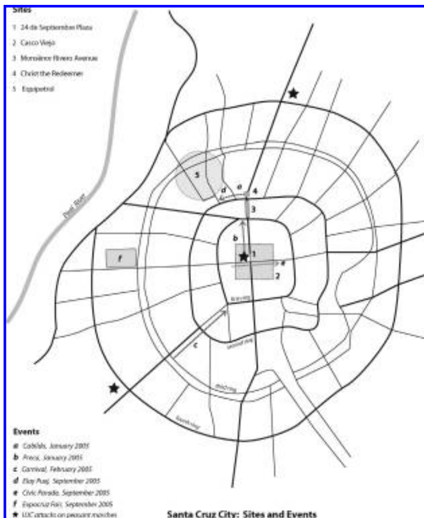
Figure 2 Santa Cruz City.