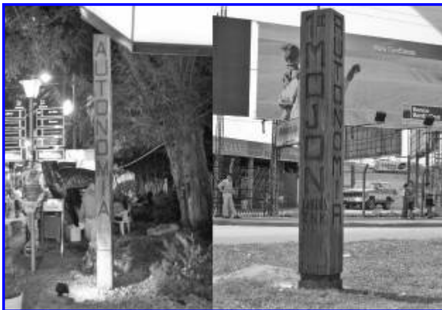
Figure 4 Landmarks ( mojones ) of Autonomy. (Left) Civic Committee's booth (right) in the median of Monseñor Rivero Avenue, near the Christ Statue.