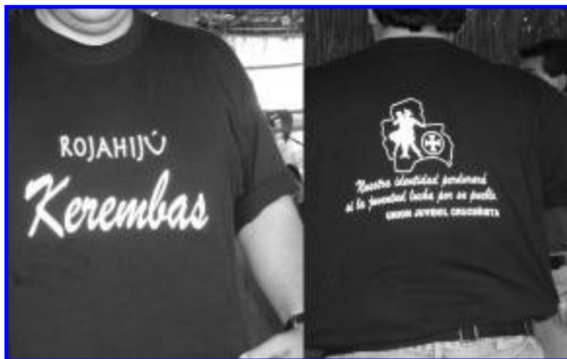
Figure 3 A member of the UJC ( Unión Juvenil Cruceñista ) and Kerembas dance troupe, September 2005. Rojahijú is Guarani for, “I/We Love You (Santa Cruz)” ( sic. roaiu ), a slogan that ties the city (female) to its gallant protectors (male). The back reads, “Our identity will endure if the youth struggle for their pueblo.” Note the outline of Santa Cruz department, a couple dancing a Cruceño musical genre, and the cross potent.